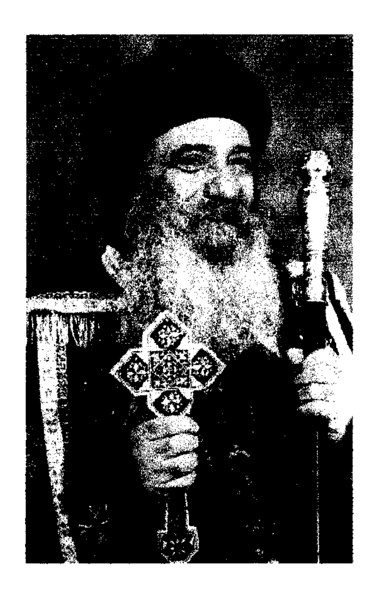
POPE SHENOUDA III, 117th POPE OF ALEXANDRIA AND THE SEE OF ST. MARK